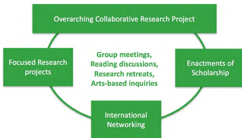
Figure 2: The Collaborative Reflective Experience and Practice in Education (CREPE) Faculty Research Group research model

The collaboration model (Figure 2) became the strength of our collaborative research. By living these elements and processes, we generated not only a stronger community, but affirmed our conceptual and methodological knowledge, skills, and dispositions. We have come to understand the nature of collaboration and live the benefits of this close collegial research through meta-reflective processes, framed theoretically and methodologically.